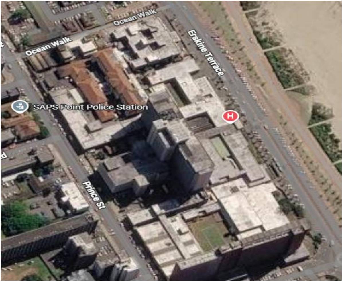
Figure 3: Addington Hospital Precinct